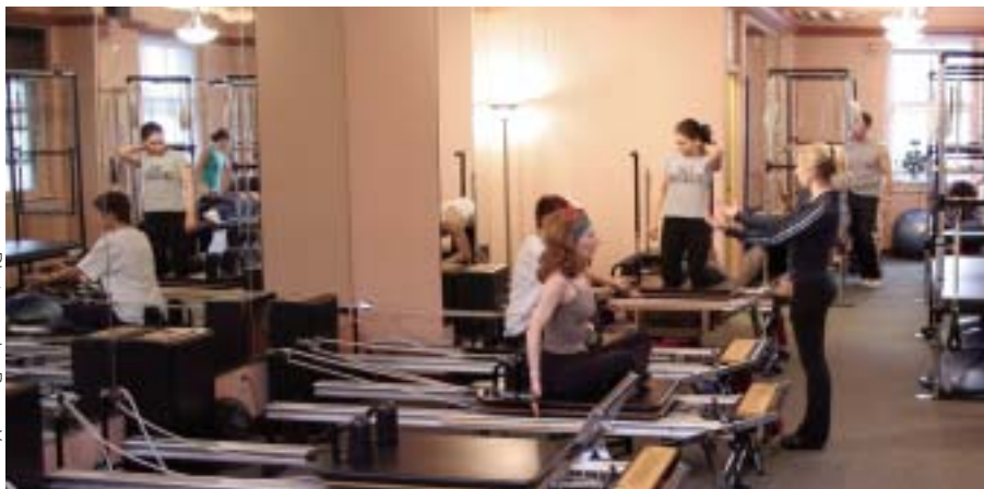
Growing room Pilates on Fifth plans to double in size by the end of next year

Upstairs, in the studio's penthouse, group mat classes are offered for beginning, intermediate, and advanced students, and there are cardiovascular units and two GYROTONIC Pulley Towers. The GYROTONIC machine, a bizarre-looking configuration of weights and pulleys that allow muscles to be worked interdependently, is among the newest additions to the Pilates on Fifth inventory, and one that's proven incredibly popular. In all, more than 800 different exercises can be performed on the studio's equipment—which can be an